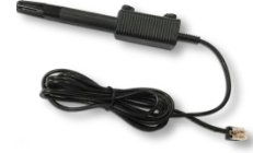
USB WIFI Dongle